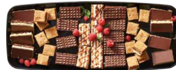
Dessert Bars Our hand-cut squares are a welcome addition to any table. Small: serves 15. Large: serves 20.