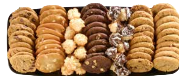
Cookie Lover's Bliss Ideal for casual entertaining and is always a hit. Assorted store-baked cookies and coconut macarons. Small: serves 10. Large: serves 20.