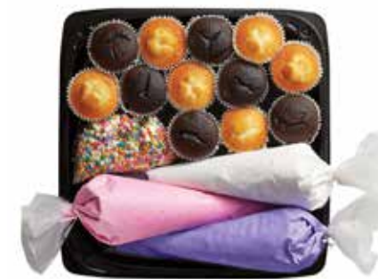
Build-a-Cupcake Kit Ready, set, start decorating! With pre-made cupcakes, ready-to-pipe frosting, and sprinkles galore, this DIY kit is perfect for kids. Makes 12.