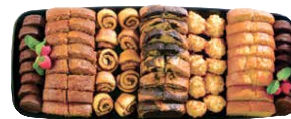
Take a Break Just right when you're serving coffee and tea. Assorted bite-size treats and sliced loaf cake Small: serves 10. Large: serves 20.