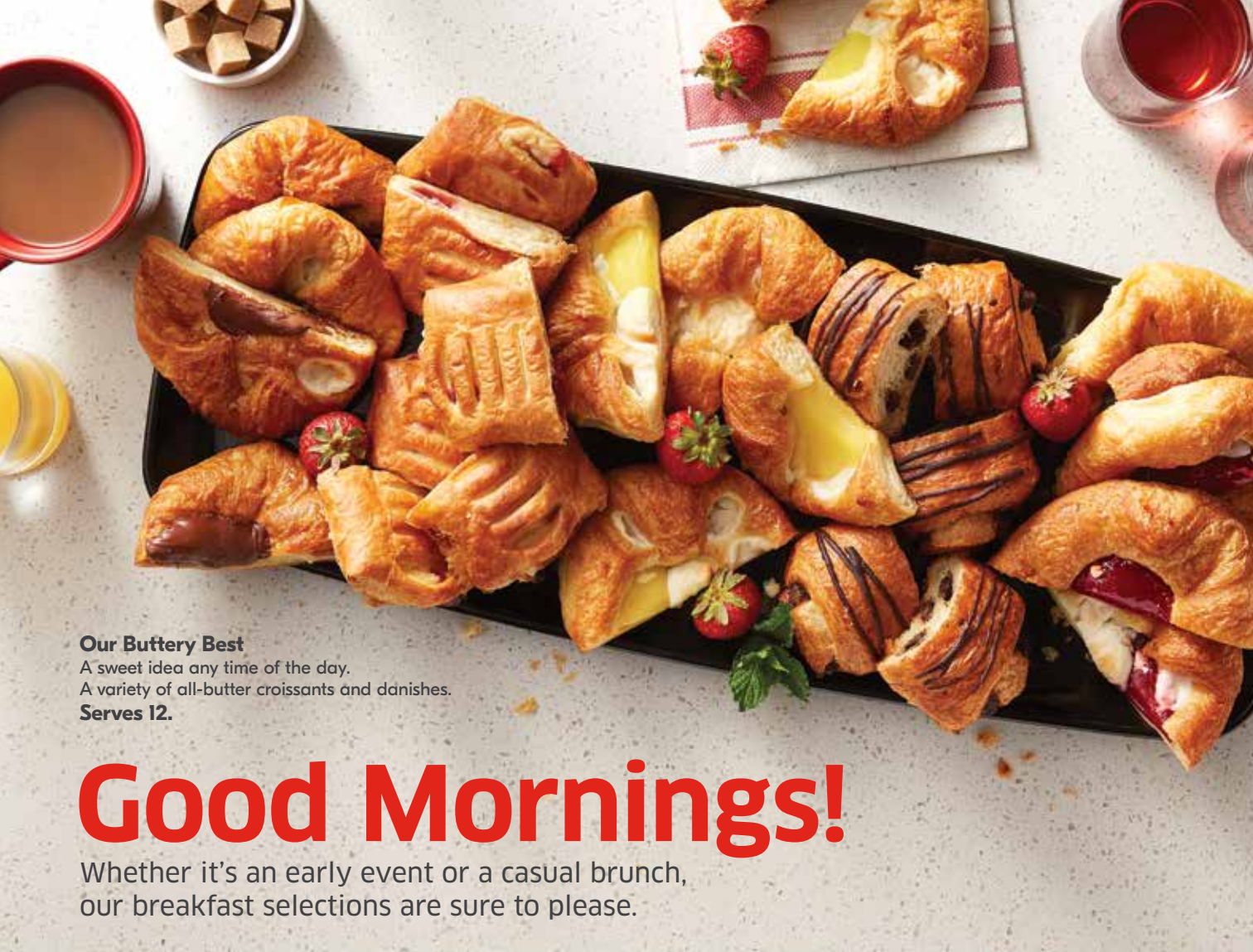
Our Buttery Best A sweet idea any time of the day. A variety of all-butter croissants and danishes. Serves 12.