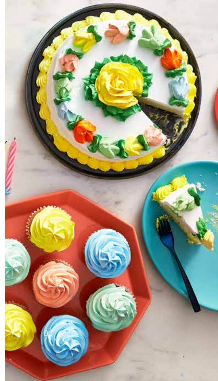
Take the Cake With one single layer 8-inch cake and 12 cupcakes, everyone can have their cake (and eat it, too). Ask store for decorating options and flavors Serves 18-25.

With our wide range of treats, your get-togethers will end on a sweet note.